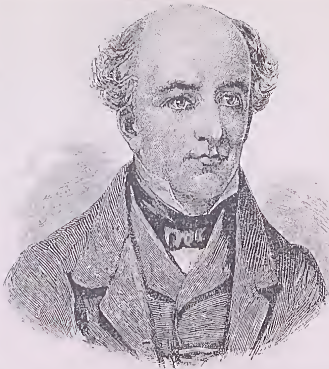
Figure 1. Allan Cunningham (1791-1839), botanist accompanying Lieut. P.P. King's hydrographic surveys of coastal Australia.